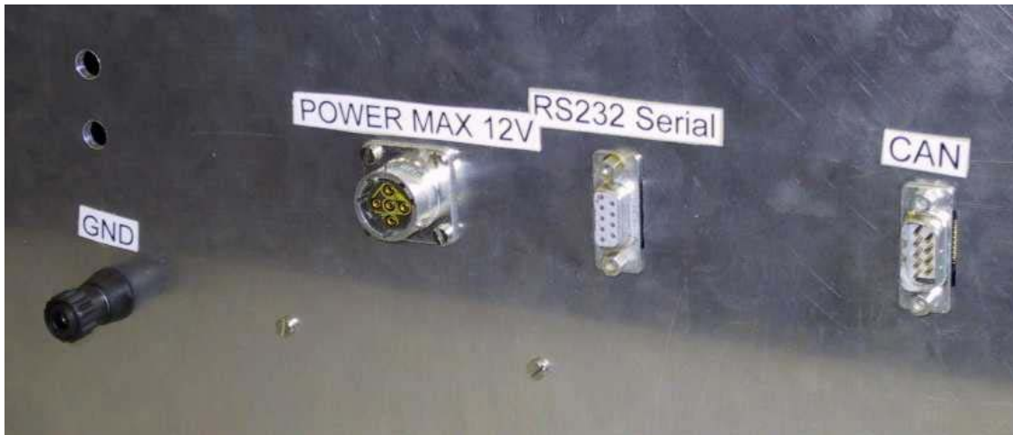
Figure 1: Rear of test box showing connectors

The test box requires some connections to be made before any tests may be run. The connections required are for power, a CAN bus and an RS232 interface. There are four connectors clearly labeled on the back of the test box.