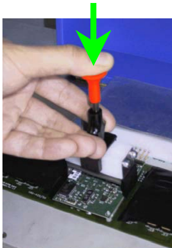
Figure 3: Placing the ELMB on the test box

The ELMB may then be placed on the top of the test box with the connectors on the bottom of the ELMB lining up with the connectors on the top of the box. The ELMB must then be pushed firmly down to make a good connection with the test box. To release the ELMB, push again on the orange top of the tool to open the jaws, and remove the tool from the ELMB.